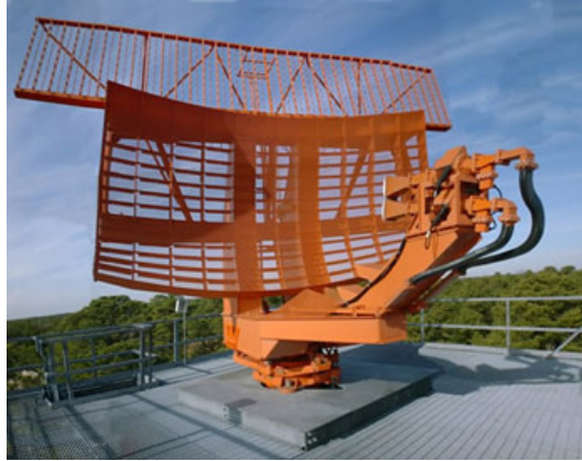
Figure 3: Example of an airport surveillance radar antenna, the ASR-9.

scale difference between the systems (in terms of range with other parameters similar) is roughly a factor of 10^6 . Airport surveillance radar typically make continuous 360^\circ rotations of the radar antenna, which has a narrow beamwidth in azimuth and wider in elevation. This can be seen from the shape of the reflector in Figure 3, which has larger aperture in azimuth than in elevation.